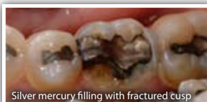
Silver mercury filling with fractured cusp