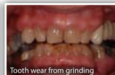
Tooth wear from grinding