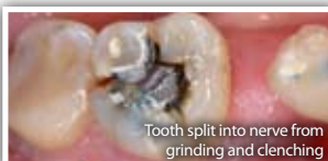
Tooth split into nerve from grinding and clenching